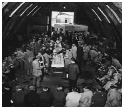
Countryside Building V5 Iss3