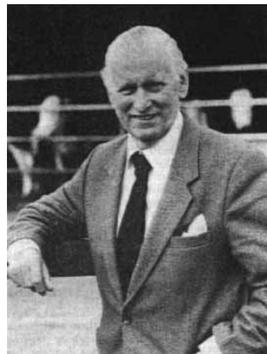
Countryside Building V5 Iss3