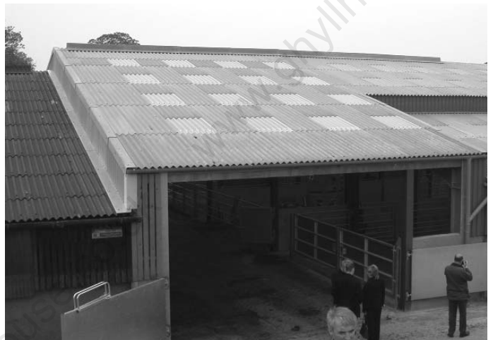
A typical situation. The old roof on the left (dark) is asbestos cement, the roof to the right is non-asbestos, very obvious now but in a few years time very difficult to see. Hopefully the ink jet on the underside of the sheets on the building on the right will still be visible to show that it is non-asbestos. This shows the value of good records.

Finding these marks can be a problem, with slates a quantity will need to be removed before the mark is found and so unless you have good reason to believe that they are non-asbestos they should be treated as an asbestos cement ACM. For roofs fixed after 1984, when the slates could be asbestos cement or non-asbestos, looking at the original specification may help but a number of specifications were changed by the roofing contractor because asbestos cement slates were cheaper than their non-asbestos alternatives, and the client and designer were not necessarily notified of the change. It may therefore be