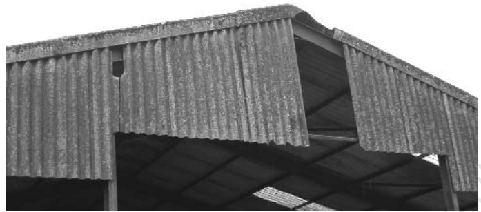
A typical gable end of a farm building roofed and clad in asbestos cement. Even though the sheets are broken they will not be releasing fibres and so can be left in place. There is no requirement to repair just because they are an ACM.

Where buildings or plant do contain ACMs it is a good idea to set controls on maintenance or building work, such as, no work must be started with out the written authority of the building controller.