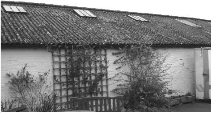
Typical old shed, Management Plan should say leave alone, check condition in 1 year

During the survey the drawings and other papers provided should be checked for accuracy. Where ACMs are found they should be clearly marked on the drawings plus their condition should be recorded. Since it is likely that these drawings will be used by employees who do not have a good knowledge of the building trade or its terminology it is important that the recording is done in such a way as to ensure that the non-expert understands not only that asbestos is present but exactly where it is present.