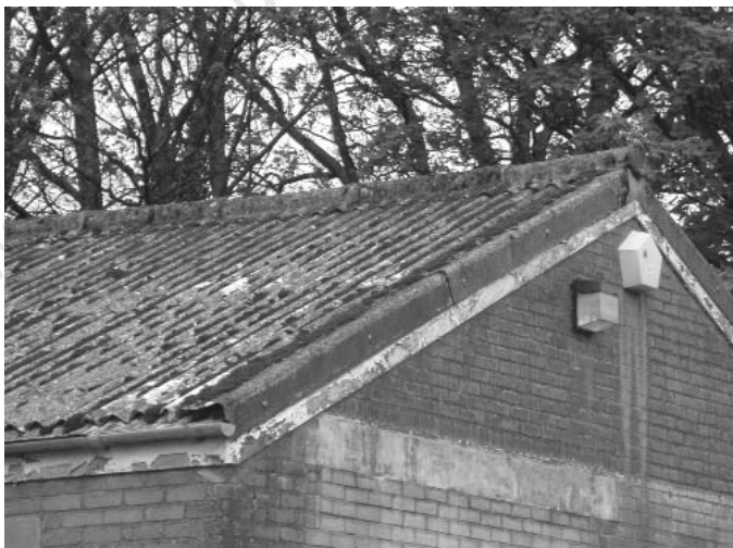
Typical old asbestos cement roof, except that the gutter has been replaced with plastic, Management Plans would say leave alone, check condition in 1 year.

This is the Duty Holder who is the entity that has control of the repair and maintenance of the building, so it can be an individual